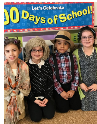
Grade 1 celebrating the 100th day of school by dressing up as wise senior citizens.

In an assembly presented by the Leukemia and Lymphoma Society, students learned about the origins and effects of cancer. They learned how they can help, even at their young ages. During the month of March, students will be collecting "Pennies for Patients." The money collected will be donated to the Leukemia and Lymphoma Society for research purposes.